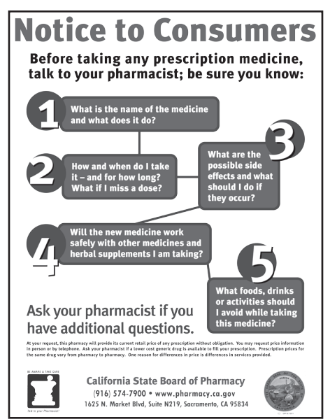
Current Notice to Consumers will be replaced.

To accommodate the additional language, there will likely be two posters. The Board is in the process of designing and producing the two notices and will be mailing them to all pharmacies by midyear 2008.