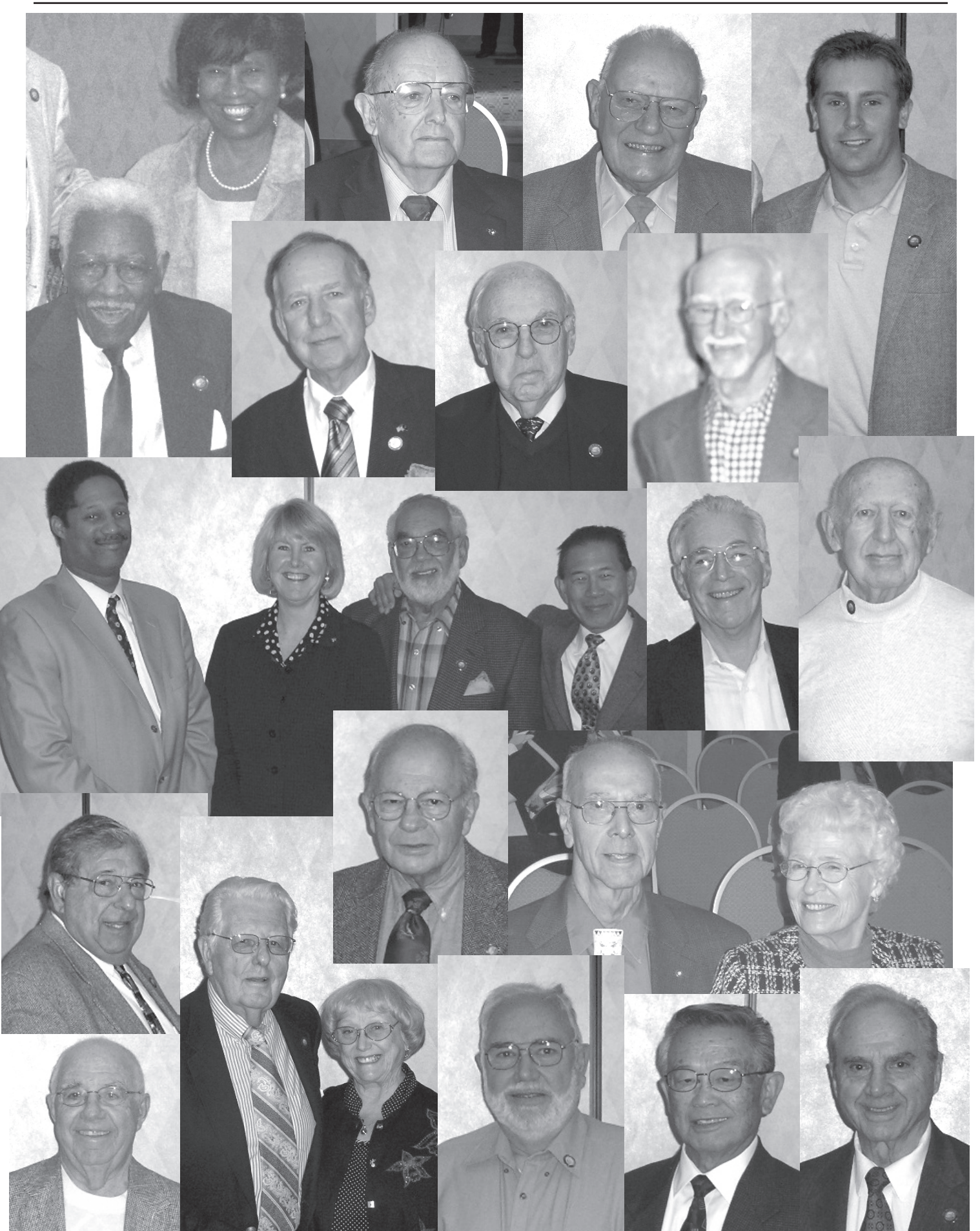
Board honorees and guests