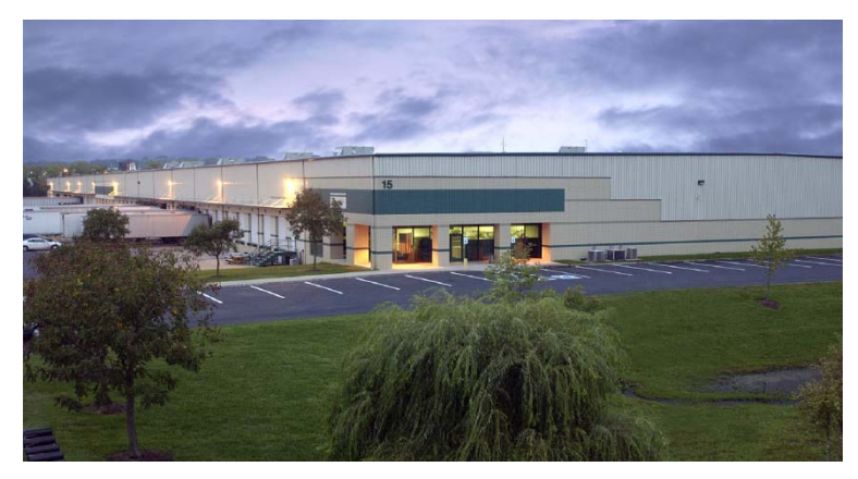
LaVergne, TN, Distribution Center